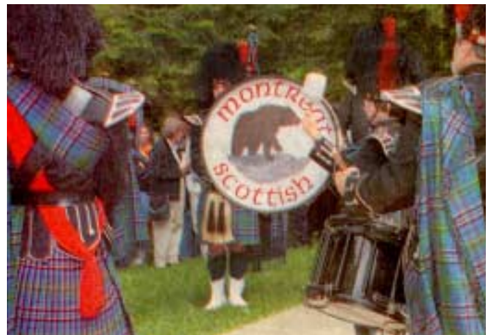
The Montreat Scottish Pipe Band gives a concert (right) at the 2003 annual Kirkin' o' the Tartan at Montreat.

The Montreat Scottish Pipe Band will give a concert on the Auditorium lawn at 10:15 am